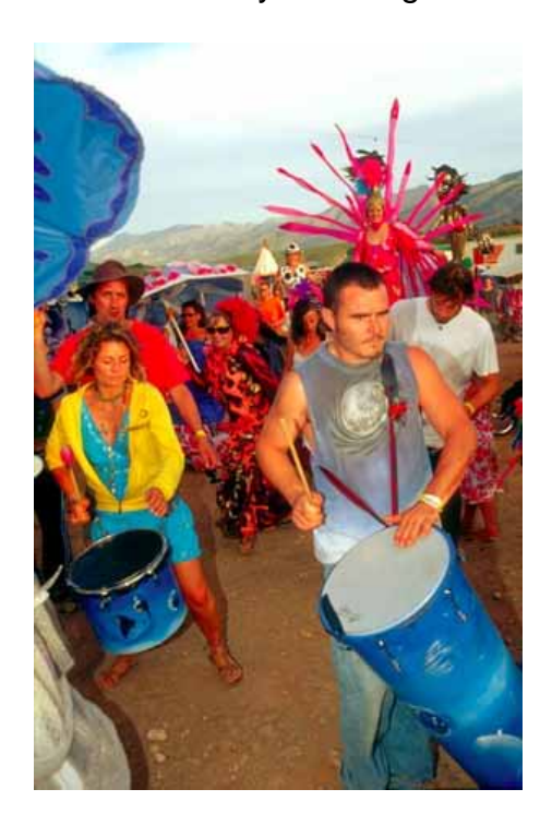
For further information please see: <a href="http://www.rocketfestival.com">http://www.rocketfestival.com</a>